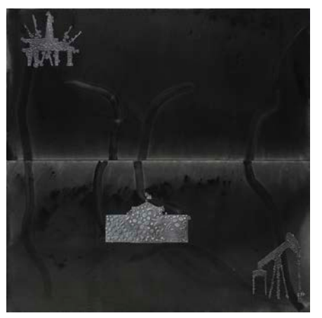
Stefan Bondell, "BROKEN LINES" (2013). Oil and gouache on canvas, 10 \times 10' . From Black Box