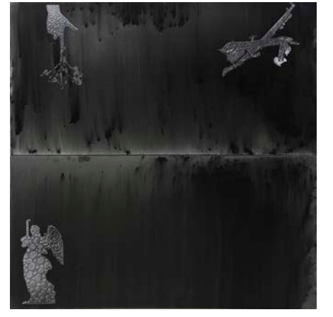
Stefan Bondell, "Dirty WINGS" (2013). Oil and gouache on canvas, 10 \times 10' . From Black Box .