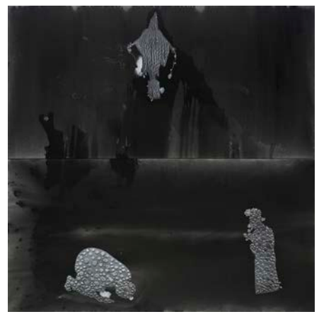
Stefan Bondell, "PYRAMID" (2013). Oil and gouache on canvas, 10 \times 10' . From Black Box .